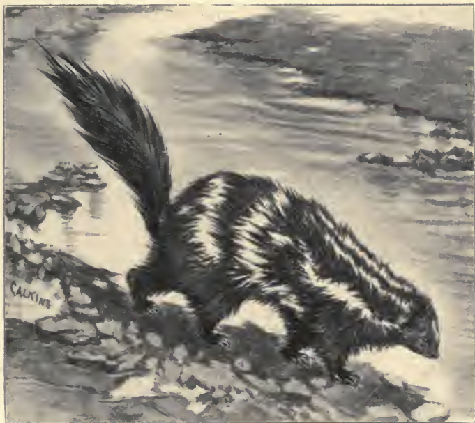
FIG. LVII. SPILOGALE INTERRUPTA. WHITE-SPOTTED SKUNK.